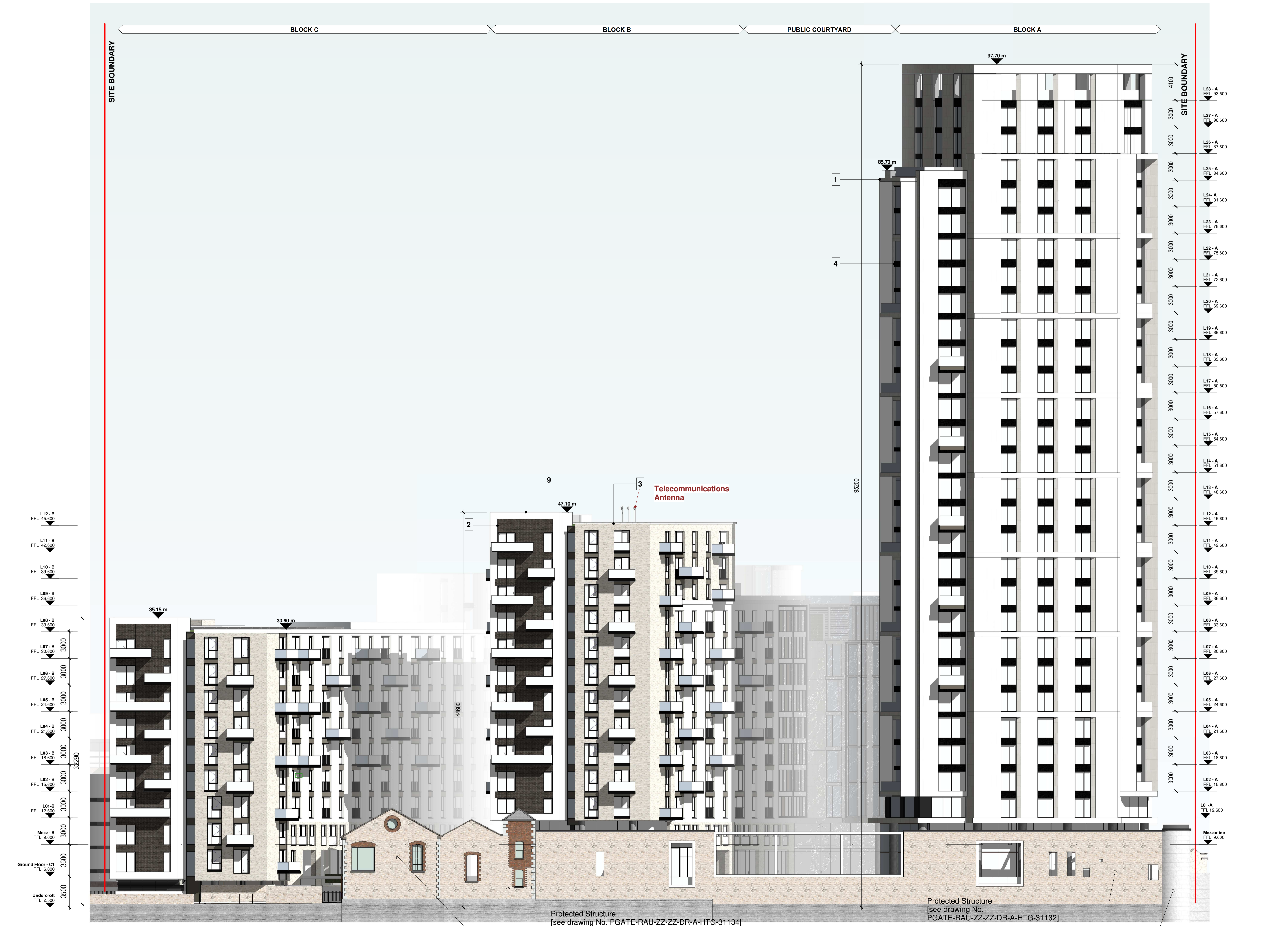
SOUTH EAST ELEVATION 1:200

Protected Structure [see drawing No. PGATE-RAU-ZZ-ZZ-DR-A-HTG-31134]